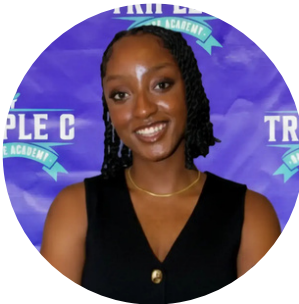
India Teaching Assistant