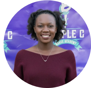
Renasia Dance Instructor