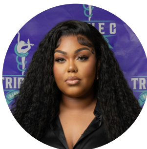
Taylor Front Desk