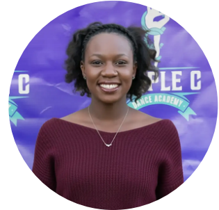
Renasia Dance Instructor