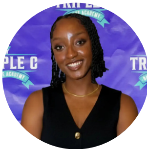
India Teaching Assistant